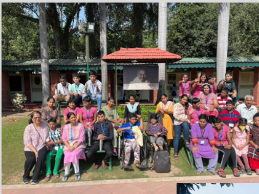
INDIA GATE & WAR MEMORIAL