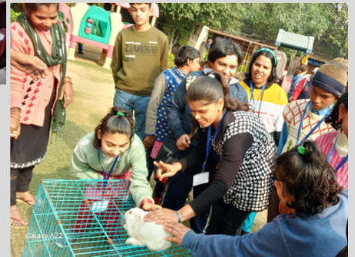
MOGLY'S PETTING FARM