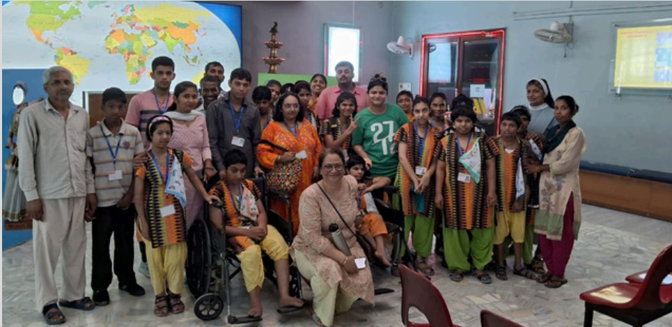
SHANKAR'S DOLLS MUSEUM

Delhi is an architectural and historical delight. We went for six field trips last year. The mention of Field trips brings a smile on the faces of our students. They look forward to the bus ride and the picnic after. Guided field trips are organised wherever needed and possible.